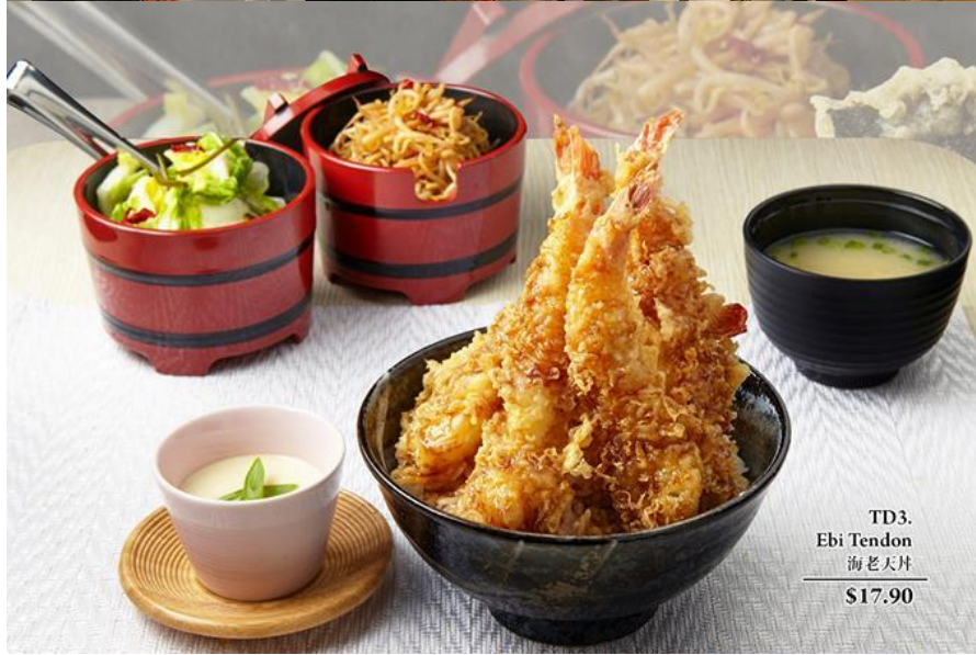
TD3. Ebi Tendon 海老天片 $17.90